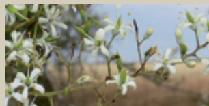
Sweet Bursaria, Christmas Bush Bursaria spinosa