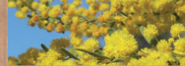
Gold-dust Wattle Acacia acinacea