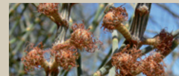
Buloke female-flowers Allocasuarina luehmannii