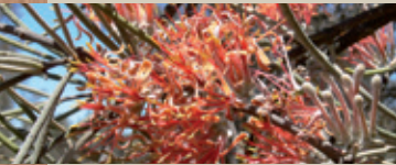
Buloke Mistletoe Amyema linophylla subsp. orientale

In 1995–96 bulldozers were used to bury the rubbish. Community volunteers helped with the cleanup and revegetation. The original vegetation was preserved and the current walking track surveyed and mown. In 1998 Parks Victoria named the area Minyip Bushland Reserve.