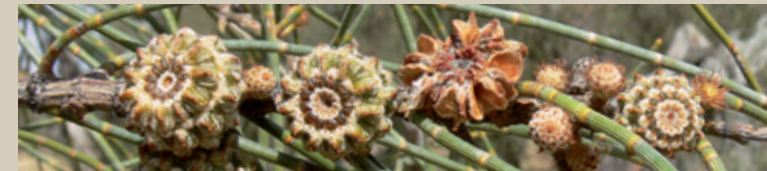
Buloke-fruit Allocasuarina luehmannii