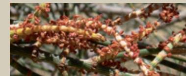
Buloke male-flowers Allocasuarina luehmannii