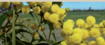
Golden Wattle Acacia pycnantha